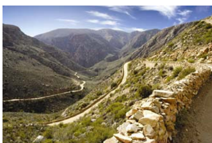
The Historic Swartberg Pass