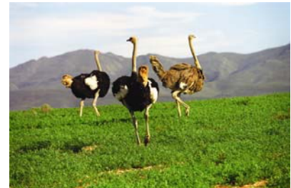
Ostriches in Oudtshoorn