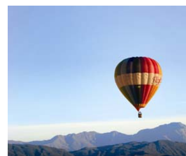
Hot-air Ballooning in Oudtshoorn