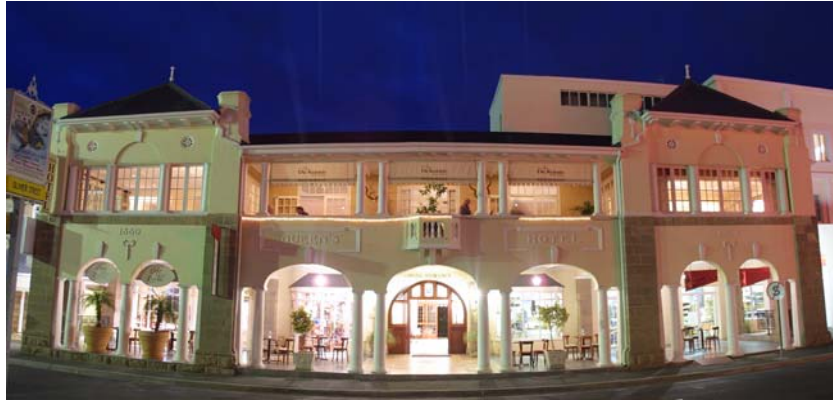
Four Star Queen’s Hotel and Conference Centre in Oudtshoorn

catering facilities with very good conference facilities. Some of our largest conference facilities—such as the De Jager Sports Centre (used as a venue for the 1 000 delegates to the sitting of the People’s Assembly) belong to the Oudtshoorn Municipality, but there is more than enough accommodation in and around Oudtshoorn to accommodate delegates to large conferences such as the People’s Assembly.