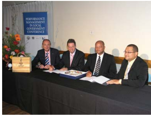
Oudtshoorn / Alphen Aan Den Rijn Performance Management Conference in Oudtshoorn: 2006