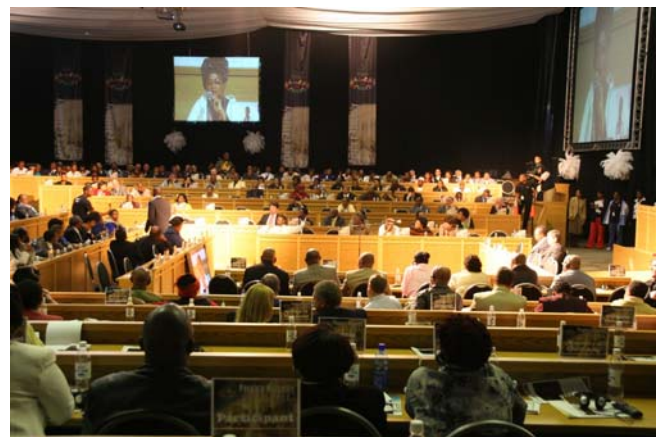
The People' Assembly of the South African Parliament in Oudtshoorn in September 2006