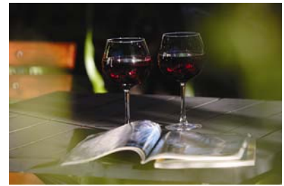
Oudtshoorn is known for its wines and fine dining

Oudtshoorn is also a regular stop-over for pre- and post conference educational tours Oudtshoorn is most suitable for conferences from May to September