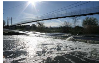
Historic Suspension Bridge