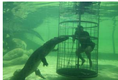
Crocodile Cage Dive