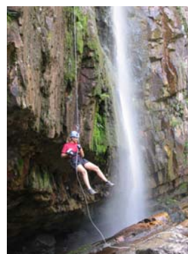
Abseiling at Rust & Vrede Waterfall