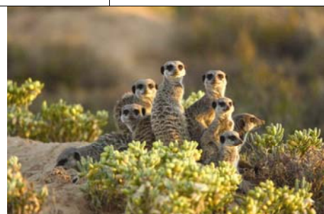
The Meerkat Magic Colony of untamed Meerkat